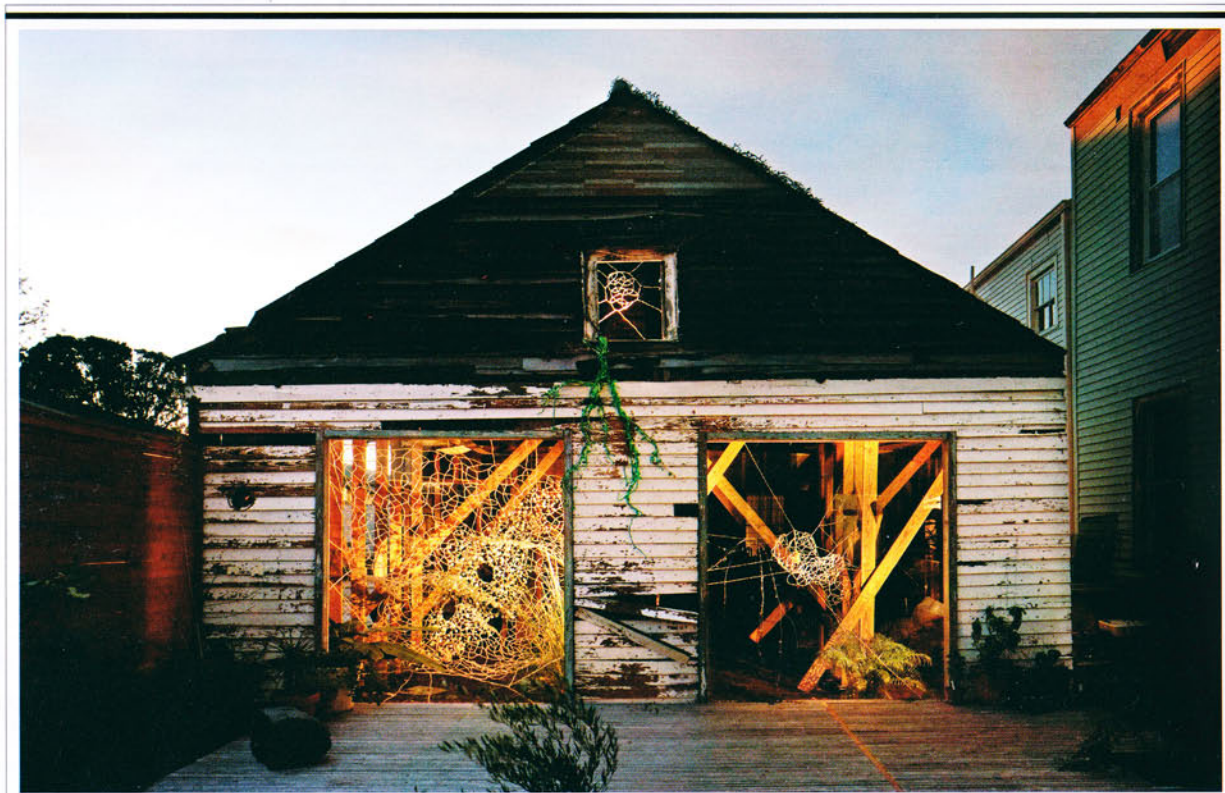
ABOVE: KAECHLE'S DERELICT COTTAGE, FEATURING CRYSTAL WEBS, BY JAPANESE ARTIST NATSU. BELOW LEFT: A GOLD-LEAF COVERED STOVE IN JEFFREY FORSYTHE'S INSTALLATION "YOU NEVER KNOW WHEN YOU ARE LIVING IN THE GOLDEN AGE." BELOW RIGHT: ANOTHER VIEW OF FORSYTHE'S INSTALLATION, LOCATED IN THE WHITE HOUSE, AT KKPROJECTS.